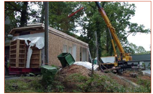
Modular homes are built in a factory and trucked to the job site, where the different modules are fastened to the foundation and each other.

"With modular construction we can do a project in a few months, so cash flow is more manageable and financing costs are reduced. Most stick-built homes