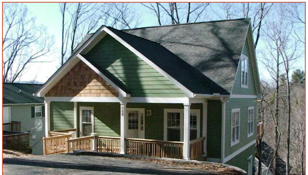
This Asheville home was the first modular home certified by the North Carolina HealthyBuilt Homes program.

The opinions expressed in this document represent those of the builder and do not necessarily reflect the views of PATH.