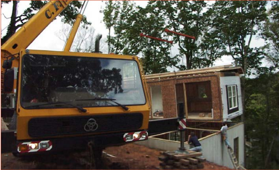
Workers guide a second-story module into place with the help of a crane.